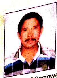
Photograph of Borrower/Mortgagor Loan Amount Is Rs. 8,00,000/- NJS worth Rs. 400/-