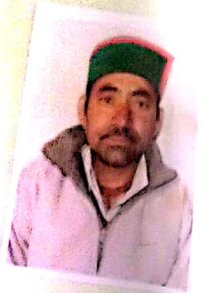
Photograph of Mortgagor Loan Amount is Rs. 3,00,000/- NDS worth Rs. 150/- Document No. 38/14 Date 18/12/2014

Handwritten signature and stamp of the Registrar, Kinnaur.